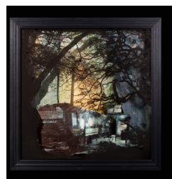
3. Where once we walked , 2025 Recycled timber, plywood, giclée prints, glass, gauge 93 x 93 x 11 cm $3,200.00