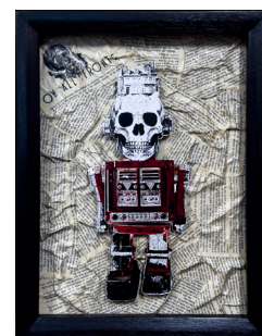
14. Architecture of The Aftermath, 2025 Handmade reclaimed timber frame, giclée prints 50 x 38 cm $650.00