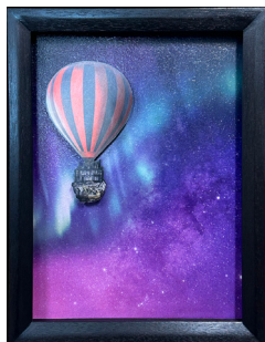
11. Adrift, night sky, 2025 Handmade reclaimed timber frame, giclée prints 50 x 38 cm $650.00