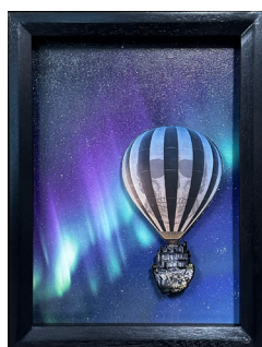
13. Adrift, Arora Skull Balloon, 2025 Handmade reclaimed timber frame, giclée prints 50 x 38 cm $650.00