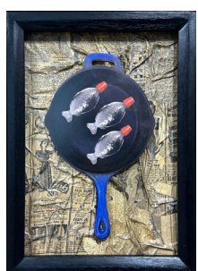
7. Catch of The Day, 2025 Handmade reclaimed timber frame, giclée prints, re-print of 1920's news found under kitchen floor 50 x 38 cm $650.00