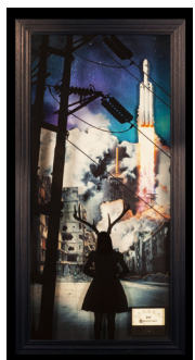
8. Last flight, 2025 Recycled timber, plywood, giclée prints, glass, heat gauge 122 x 62 cm $3,800.00