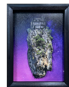
16. Cliff House, Night Sky, 2025 Handmade reclaimed timber frame, giclée prints 50 x 38 cm $650.00