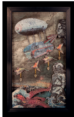
2. Mobile home , 2025 Recycled timber, plywood, giclée prints, glass, found objects 132 x 80 x 11 cm $4,200.00