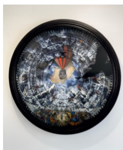
5. Adrift, 2025 Handmade reclaimed timber frame, wood, giclée prints, Silver leaf, glass print and found objects. 125 x 125 x 11 cm $6,700.00