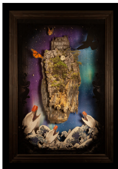
1. Eugene's Ark: A butterfly Flaps its Wings , 2025 Recycled timber, plywood, giclée prints, glass print, pocket watch 126 x 86 x 11 cm $4,200.00