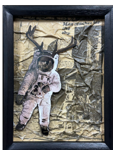
9. The Astronauts Fable, 2025 Handmade reclaimed timber frame, giclée prints 50 x 38 cm $650.00