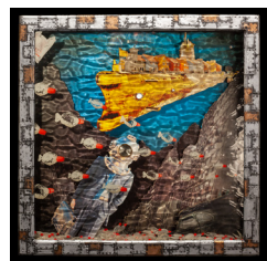
4. Houseboat , 2025 Handmade reclaimed timber frame, wood, giclée prints, glass print, copper, steel, found objects. 92 x 92 x 11 cm $3,800.00