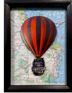
15. Adrift, red balloon, 2025 Handmade reclaimed timber frame, giclée prints, map 50 x 38 cm $650.00