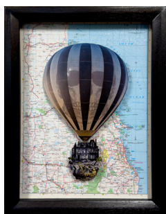
10. Adrift, skull balloon, 2025 Handmade reclaimed timber frame, giclée prints, map 50 x 38 cm $650.00