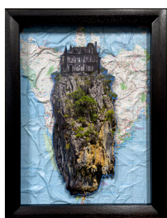
12. The Cartographer's House, 2025 Handmade reclaimed timber frame, giclée prints, map 50 x 38 cm $650.00