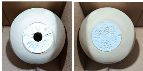
ocellus , 2025, porcelain with lithophane

PRAXIS ARTSPACE 68-72 GIBSON ST, BOWDEN, SA, 5007 PRAXIS@PRAXISARTSPACE.COM +61 8 7231 1974 PRAXISARTSPACE.COM