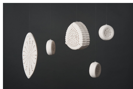
planktos , 2025, porcelain, dimensions variable.

ENTIRE INSTALLATION: $4,800 INDIVIDUAL PIECES: $80, $180, $250 (size dependant) CLUSTER OF 10: $1,500