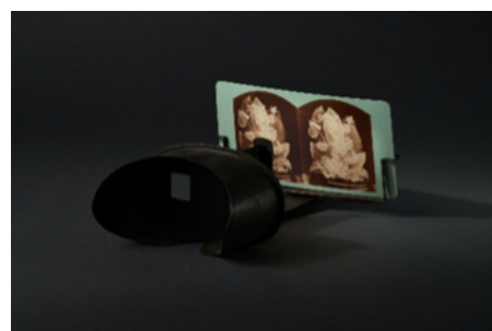
stereo , 2025, photographic film image (taken with Sputnik stereoscope camera) on card, found stereoscope viewer

ENTIRE INSTALLATION: $4,800 INDIVIDUAL PIECES: $80, $180, $250 (size dependant) CLUSTER OF 10: $1,500