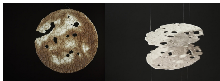
conectere , 2025, porcelain, nylon thread and blue light, dimensions variable.

dimensions: 22cm x 22cm x 22cm. UNIQUE: $2000