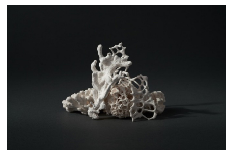
skeletos , 2025, porcelain, found glass jars, dimensions variable.